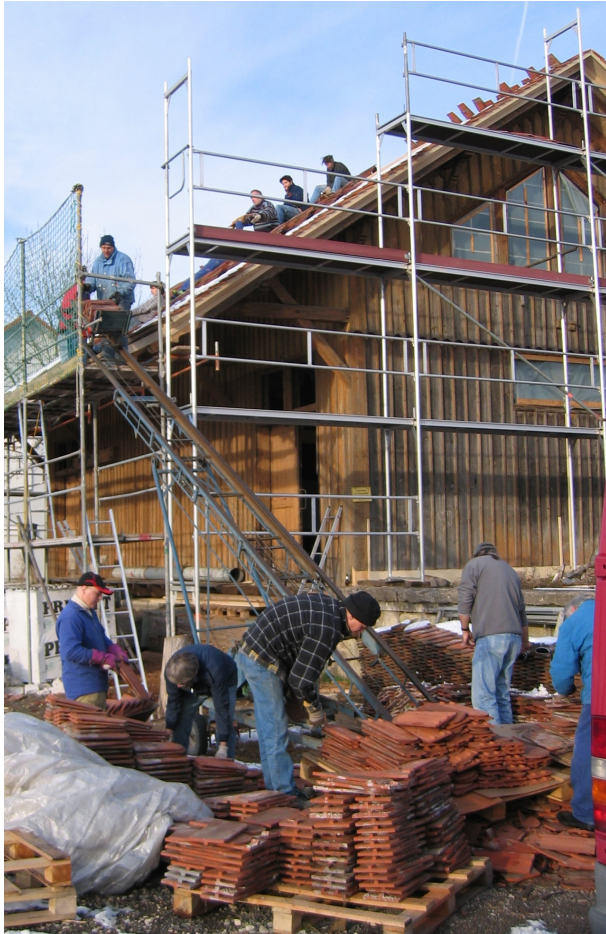
making of Kulturgüter-Schuppen :