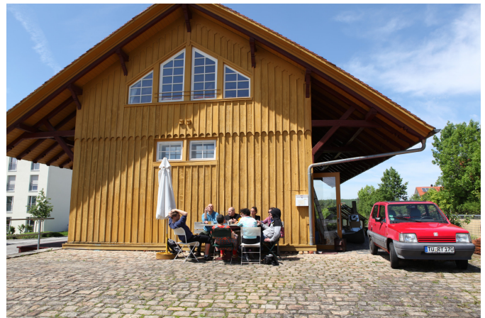
friends from switzerland performing :