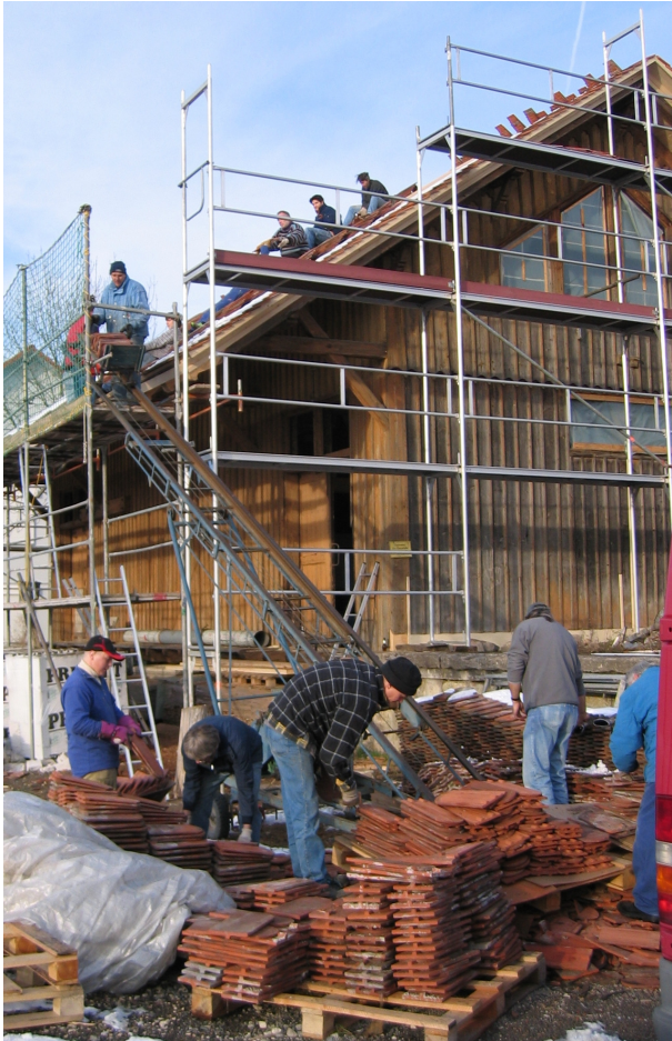
with Wolfgang "Fadi" Dorninger & students from Linz 2013 :