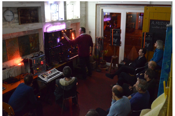
A.MODSART (analog modular synth art) gathering 2018